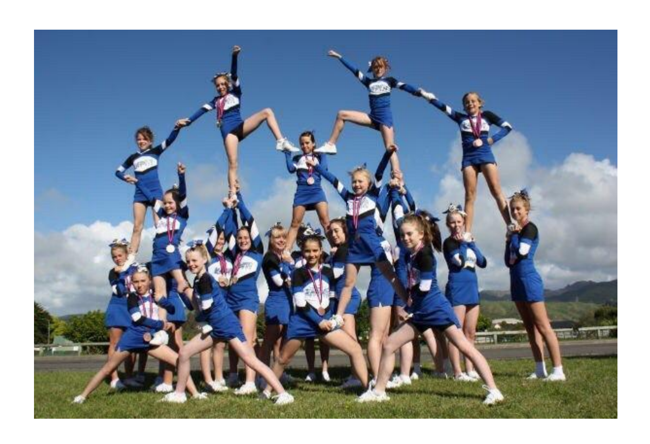
Test 5. Health Club

You will listen to the conversation between the gym instructor and the member of the club. What issues are they discussing? Which of the instructor's recommendations do you find most helpful?