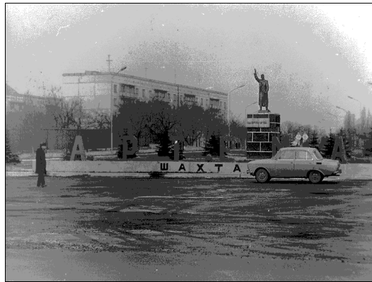
Fig. 1. Entrance to the city of Artemivsk in Lugansk region. Monument to Artem

The urban infrastructure is obsolete and local mayors are considered successful when they provide some cosmetic improvements to city centres. The European football championship of 2012 left behind a few stadiums and hotels in Donetsk, but had nothing like the impact on the economy promised by the Yanukovych government (Zhurzhenko 2014).